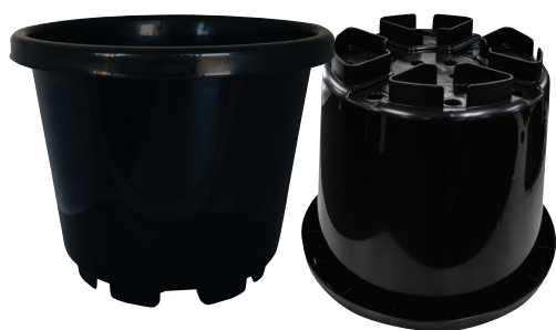
420mm Slimline Pot with Feet