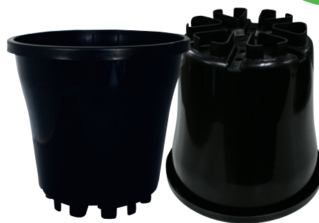
250mm Euro Pot with Feet