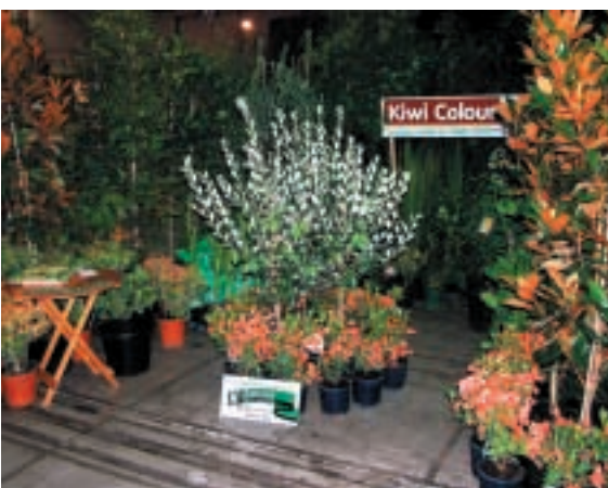
Left: Kiwi Colour showed some of their larger landscape grades