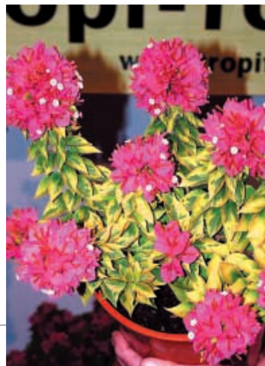
Tropi-Folia's new dwarf Bougainvillea Pixie Queen