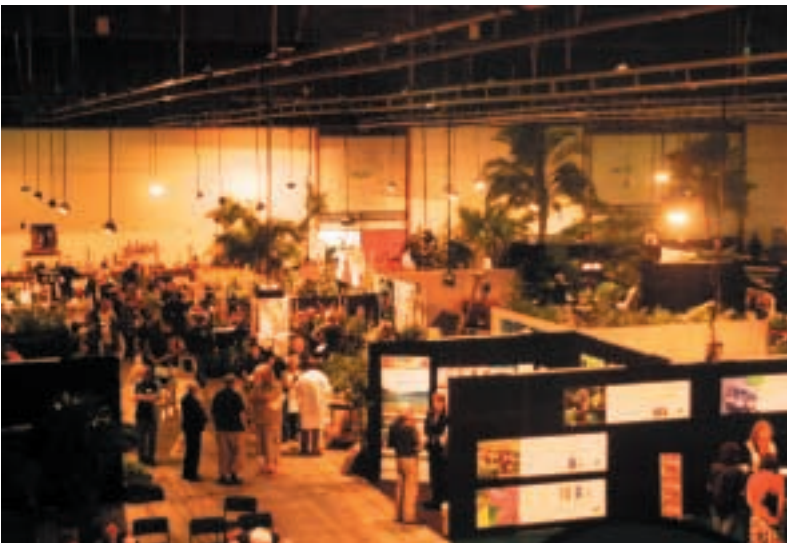
Above: Auckland Trade Day - 'Accentuate the Positive'

Roses will always have a market and the long Summer meant Roach's Nursery still had some of its colourful range in bloom including the striking new floribun-